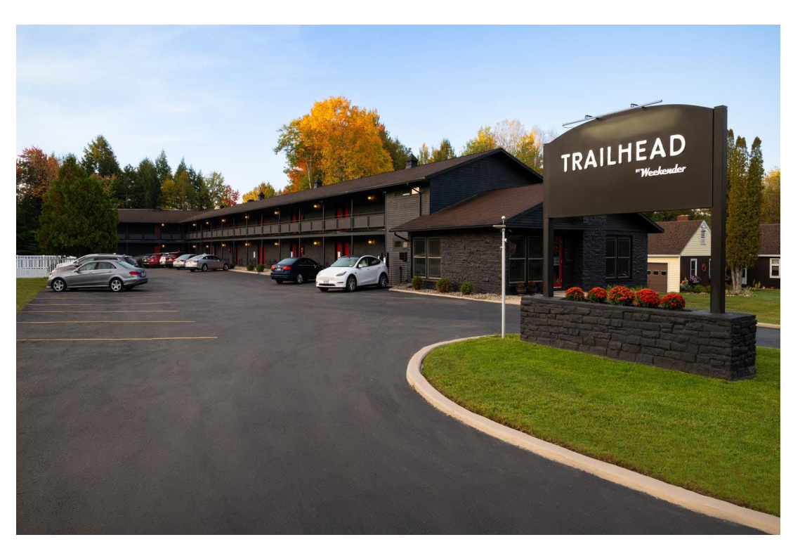
Trailhead, Franklin County